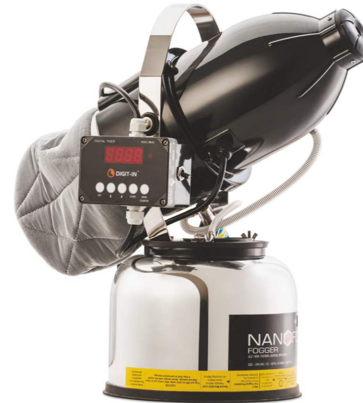
3018 SFD / 3020 SD