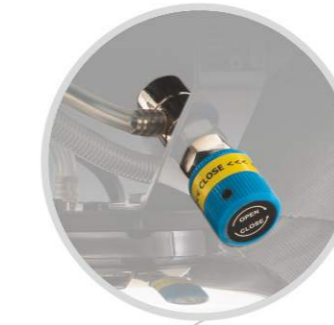
SS316 Grade Flow Control Mechanism