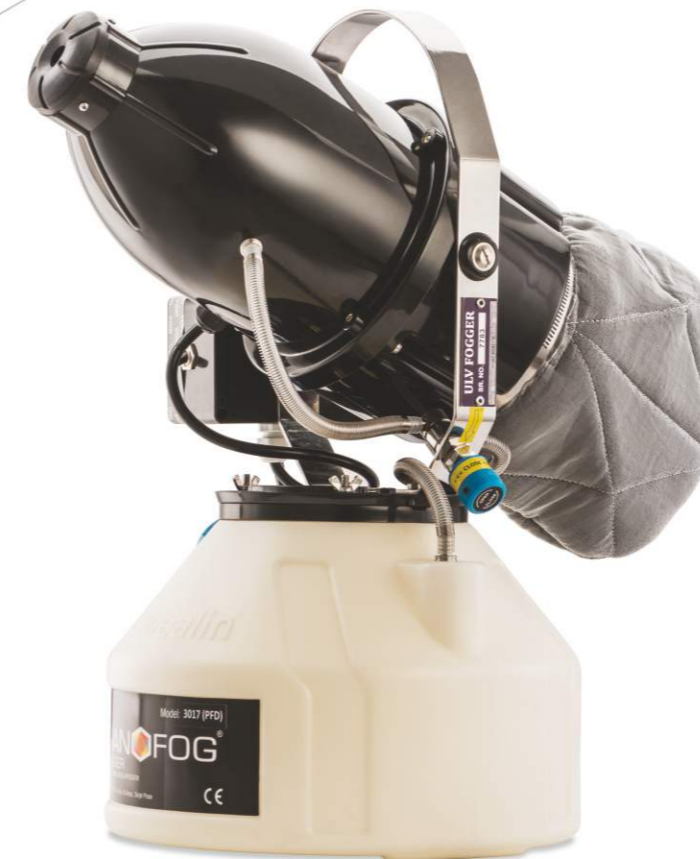
3017 PFD / 3019 PD