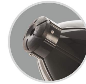
Advance Thrust Design Air-Jet Nozzle