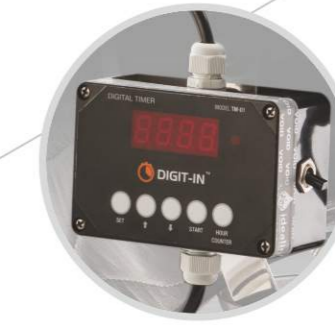
Digital Timer with inbuilt Hour Counter